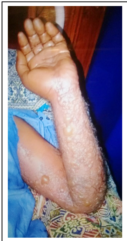
Fig.1: Maculopapular raised, fluid filled vesicular lesions at multiple dermatomes of left arm of a 50-years old male patient clinically suspected with herpes zoster.

Patient's blood sample was sent to Department of Virology, National Institute of Health (Islamabad). Upon serological analysis, the serum sample found negative for Measles, Rubella and Dengue; however, was detected positive for anti-VZV IgM using the ELISA kit (Viricell Spain, Cat#19EVZV101). To confirm the causative pathogen, vesicular lesion swab was analyzed at Molecular Medicine Laboratory (Department of Microbiology, Quaid-i-Azam University, and Islamabad) after DNA extraction via QIAmp DNA Mini Kit (Cat#51306). The PCR followed by Sanger sequencing was carried out. Amplification of targeted regions of three ORFs; ORF 22 (37837-38356), ORF21 (33497-33999) and ORF 54 (95109-