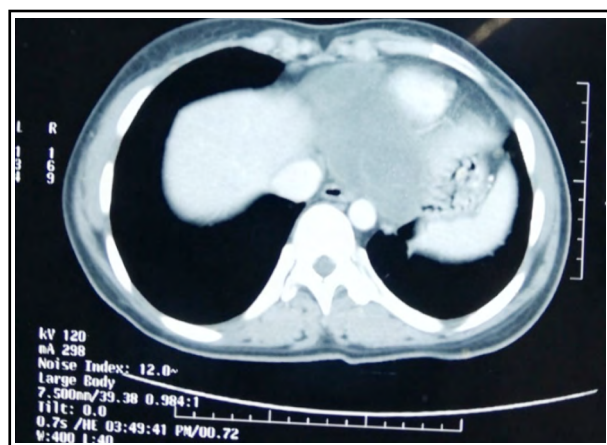
Fig.1: Hypodense lesion along the inferior cardiac margin with linear hyperdensities within the lesion.

course remained uneventful, and patient was discharged on 5 th post-operative day with albendazole 10mg/kg/day with two weekly cycles for three months.