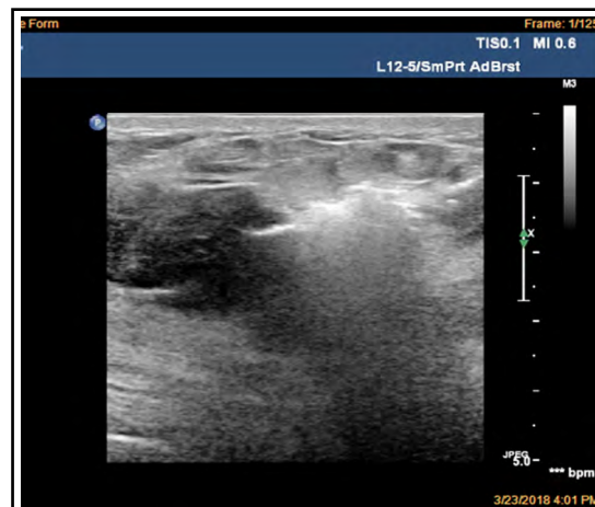
Fig.3: Microwave ablation of breast pseudoaneurysm.

In the treatment of pseudoaneurysm, the commonly used methods included the ultrasound-guided local directional compression, percutaneous prothrombin injection, 5,6 surgical ligation of blood vessels and hematoma resection. 7,8 For this patient, after diagnosis the ultrasound-guided local directional compression was established immediately. Five minutes later, the patient appeared obvious chest tightness and shortness of breath symptoms, so the compression was stopped. Then, we urgently contacted the drug bank, and were informed that the prothrombin was out of stock. Meanwhile, the artery diameter in pseudoaneurysm was larger (0.7 cm). It was reported that the artery diameter larger than 0.8 cm was the relative contraindication of prothrombin or anhydrous alcohol injection. In addition, the patients had higher requirement for the perfect