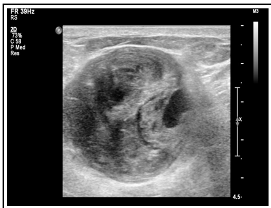
Fig.1: Conventional ultrasound of right breast pseudoaneurysm combined with hematoma.

rotary cutting needle. The histopathology showed the breast sclerosing adenosis combined with reactive lymph node hyperplasia in the right-side mass and breast fibroadenoma combined with local acute and chronic inflammatory cell infiltration and micro abscess in the left-side mass. On the third day after the surgery, the patient came back to the hospital. She complained that, after the removing the bandage at postoperative 48 hour, there was a mass in the right breast. The mass then became larger and larger, and the pain became more and more serious. When she arrived at the hospital, she was difficult to lift the right hand up. The conventional ultrasound examination showed an uneven hypoechoic mass (about 6.7 cm* 3.5 cm* 5.3 cm) in the right upper breast quadrant, with a pulsatile dark area (about 1.1 cm* 0.7 cm* 0.5 cm) at the inner edge (Fig.1). The color Doppler ultrasound showed red-blue alternating blood flow signals, with biphasic arterial spectrum (Fig.2). This suggested that the pseudoaneurysm accompanied by huge hematoma was formed.