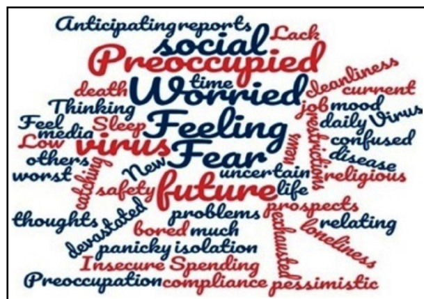
Fig.1: Pictorial Description of Psychosocial Reactions Experienced by Students during COVID-19.