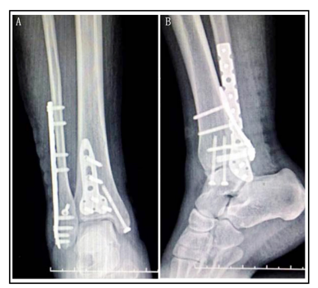
Fig.3: Surgical method for support plate group. A: Postoperative frontal X-ray film of ankle joint; B: lateral X-ray film.

Surgical method for support plate group: The fixation method of external malleolus fracture was the same as that of the cannulated screw group. An incision was made along the starting point of muscle on the outer edge of flexor pollicis longus, extended to the proximal side, and then pulled to the medial side. The peroneus longus and brevis muscles were pulled to the outside to expose the posterior malleolar fracture block, which was peeled off to the proximal end to clean