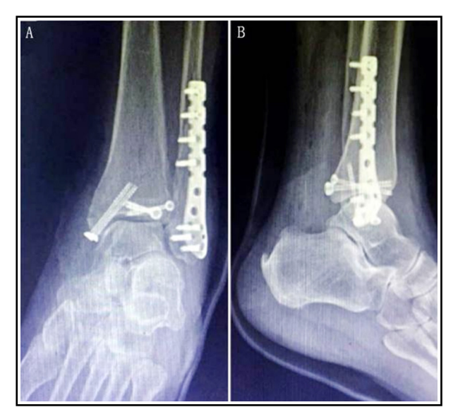
Fig.2: Surgical method for cannulated screw group. A: Postoperative frontal X-ray film of ankle joint; B: lateral X-ray film.

two cannulated screws (4.0 mm) were screwed. The position was changed to be supine, and the arc-shaped incision of the facies anterior of medial malleolus was taken to fully expose the fracture end of the medial malleolus fracture, and the soft tissue of the fracture end was cleaned. The fracture was restored under direct vision, and temporarily fixed by two guide needles. The intraoperative C-arm X-ray fluoroscopy revealed the reduction was good, and two cannulated screws of suitable length were screwed after drilling in turn to measure the depth. The Cotton test was performed to examine the distal tibiofibular stability. The instable part was fixed by 3-layer infracortical distal tibiofibular screw about 30° to the inclined forward inside of the lateral malleolus. Then C-arm X-ray fluoroscopy was carried out to find a good reduction, the incision was flushed, and the hemostasis was fully stopped. A negative pressure drainage tube was placed into the posterolateral incision which was performed with tensionreduced suture layer by layer (Fig.2).